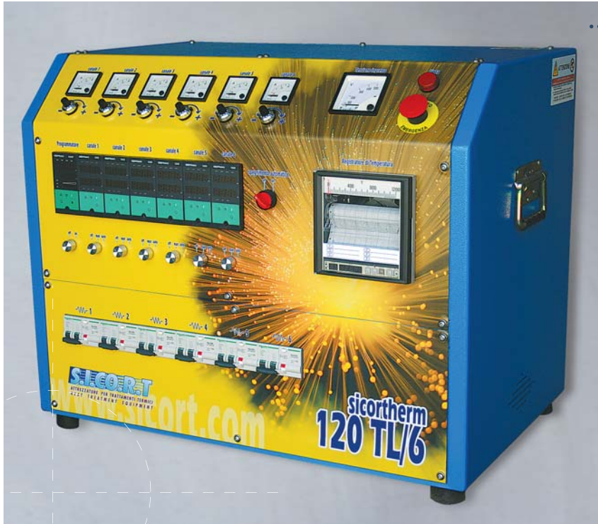
High tension units mod. TL